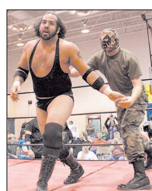
The Masked Ranger runs his opponent around the ring.